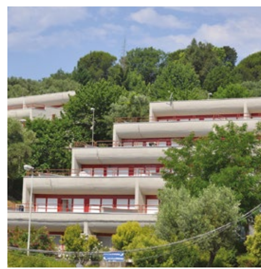
UniCal is among the first Italian universities in the Censis ranks with excellent scores in terms of services provided and scholarships.